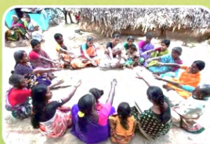
Support to FPOs/ SHGs/ Cooperatives