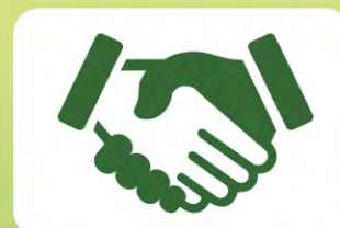
Branding & Marketing