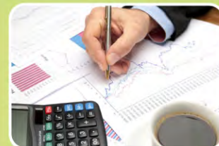
DPR and FUPs